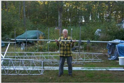
"Thunder Boomer" fully assembled