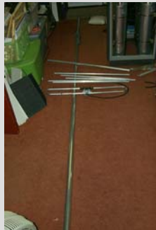
Unpacked and ready for assembly